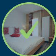
HOTEL ROOM IN ZINAL