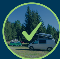
CAMPING IN GRIMENTZ