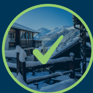
GUIDED TOUR OF THE VILLAGE OF ST-LUC