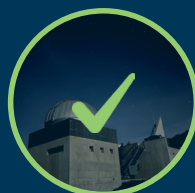
ASTRONOMICAL EVENING AT THE OFXB