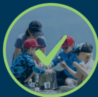
FONDUE HIKE IN CHANDOLIN