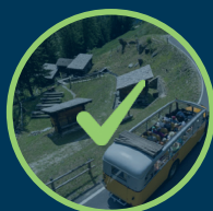
PANORAMIC TOUR IN AN OLD SAURER BUS