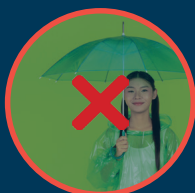
UMBRELLA IN CASE OF BAD WEATHER