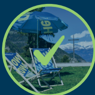
VAL D'ANNIVIERS DECKCHAIR