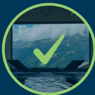
ENTRY TO THE CERVIN BATHS