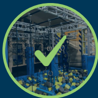
ANNIVIERS INDOOR PARK