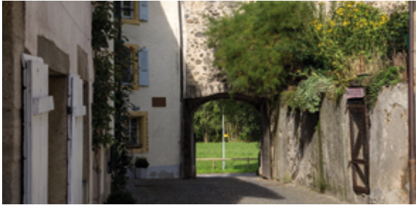
9. Porte de la Rochette