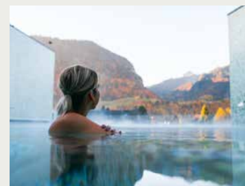
Les Bains de la Gruyère, Charmey

Which of the attractions below are the five most popular places in FRIBOURG REGION? Try your luck at www.fribourgregion.ch/quiz to win a Magic Pass worth CHF 499.