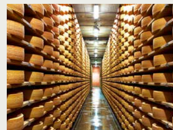
La Maison du Gruyère, Pringy