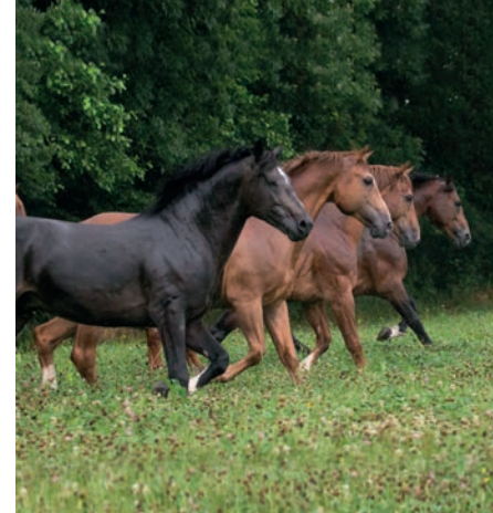
Research – accurate interpretation of equine behaviour is vital for successful horse management. Differences in equine stature - how much is down to genetics?

Horse breeding activities at the SNSF mainly focus on the Franches Montagnes (FM) horse breed – the only remaining native horse breed in Switzerland. The SNSF owns around sixty FM stallions which are made available to breeders throughout Switzerland to carry out their covering duties in various outlying studs during the breeding season. Alternatively, breeders can access frozen semen from any of a large number of stallions whose semen is stored in the stud's sizeable sperm bank. Breeding related research emphasis is placed on projects involving the maintenance of the FM breed's genetic diversity and the enhancement of its market appeal. Furthermore, the SNSF supports the horse