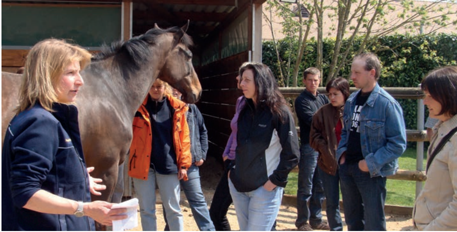
Knowledge transfer – instruction in equine husbandry

projects focus on the genetic basis of conformational, behavioural or health related features attained through analysis of DNA, and on processing and presenting these findings so that they can be practically applied by the horse breeding industry. A large number of scientific and trade publications, as well as leaflets on various aspects of the Swiss equine industry or specialized issues such as optimizing feed quality are further examples of the multitude of projects and activities taking place in Avenches.