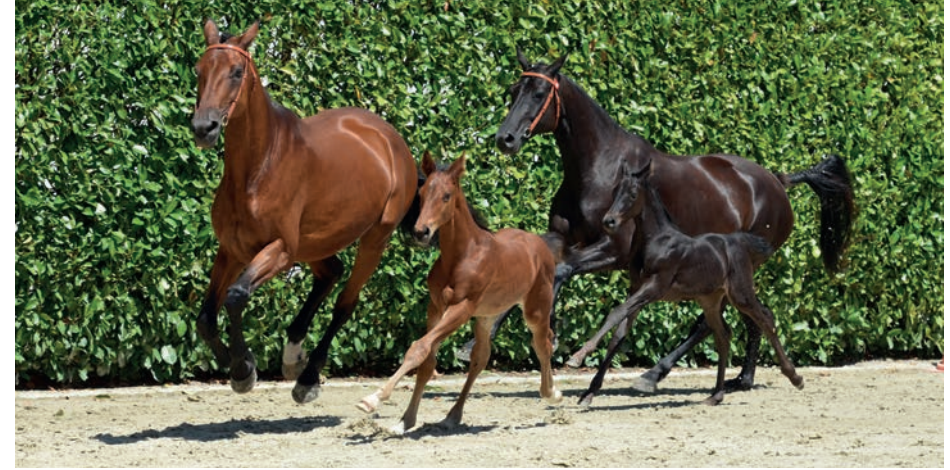
Reproduction – a sperm and an egg cell join to create the next generation

The husbandry of horses raises many questions, and the equine advisory centre at the SNSF is there to provide answers. With a network of equine specialists from all branches of the equine industry, the equine advisory service provides expert support and impartial advice to owners, breeders and yard managers as well as to equine organisations, equine professionals, authorities and any other interested persons. The SNSF also offers vocational training for people in, or thinking of entering, the equine industry, and provides training services for horses in a variety of disciplines. Vocational training and courses (e.g. Equigarde®) are often run in association with partner institutions such as the School of Agricultural, Forest and