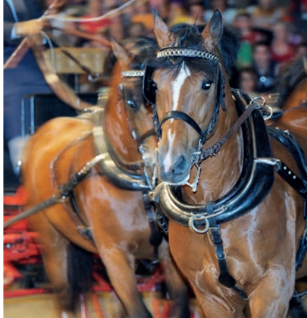
Classical riding and carriage driving – expertise at the SNSF